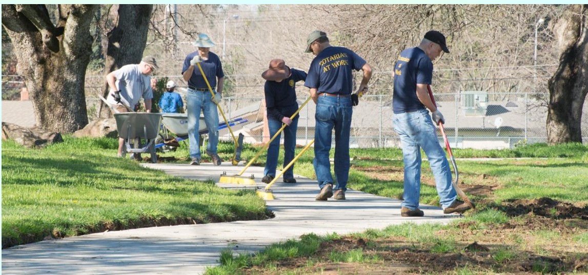
Club members working on the recreation trail in Phoenix Park.